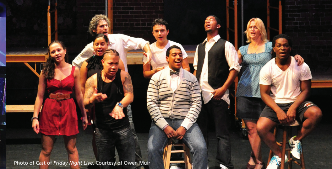
Photo of Cast of Friday Night Live